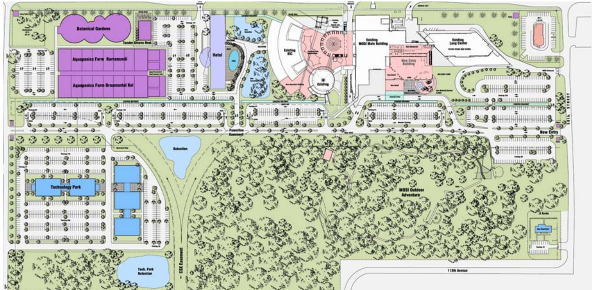
MOSI Site Master Plan (Image: Alfonso Architects)

The Museum of Science & Industry (MOSI, Tampa) plans to build the Nation's first STEAM Zone, a Science, Technology, Education, Arts & Mathematics development transforming their 73-acre site.